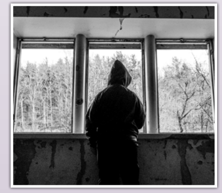
Gabriel Greene Where We Used to Stand Gold Key Photography