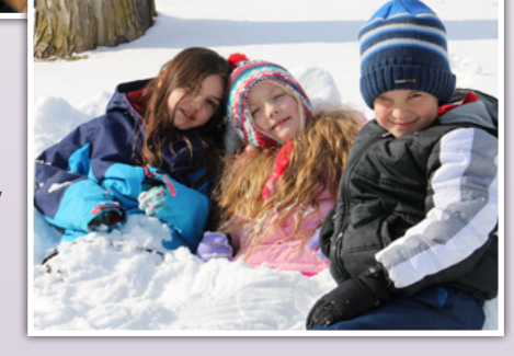
CASSAVANT ELEMENTARY ENJOYS THE SNOW DURING RECESS