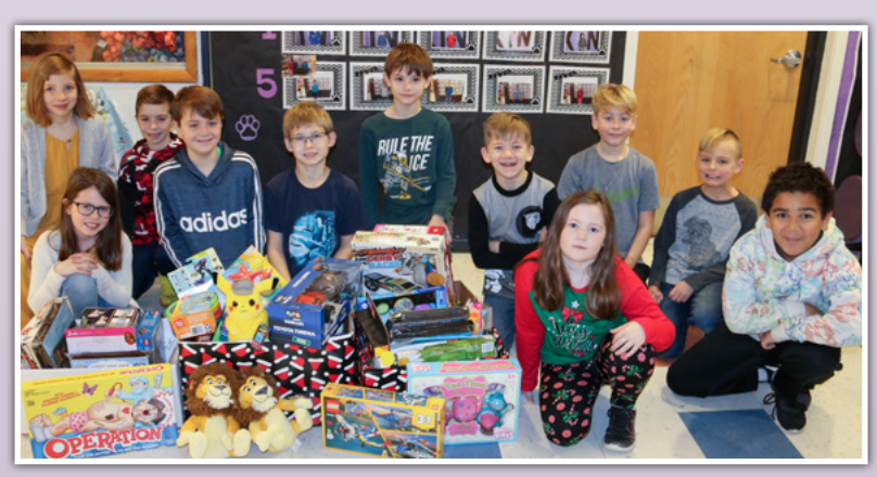
DES COPS, KIDS AND TOYS