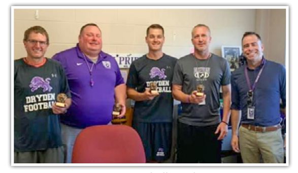
Varsity Football Coaches